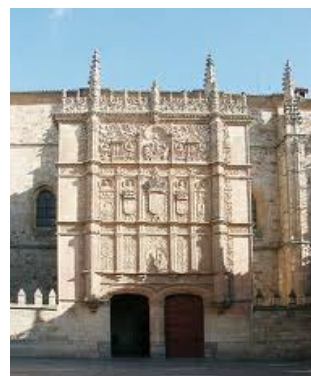
Old Facade – Universidad de Salamanca

Salamanca is a city in western Spain, in the region of Castilla and León. Because of its beautiful buildings and urban environment, the Old City was declared a UNESCO World Heritage Site in 1988. It is the most important University City in Spain and is known for its contributions to the teaching of the Spanish language. Salamanca attracts thousands of international students, generating a diverse multicultural environment.