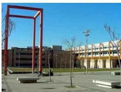
Universidad de Salamanca – New Campus

The Facultad de Economía y Empresa is located in the new campus of Universidad de Salamanca, just some minutes away from the bus station. The main entrance to the Course Venue is from 'Paseo de Francisco Tomás y Valiente'.