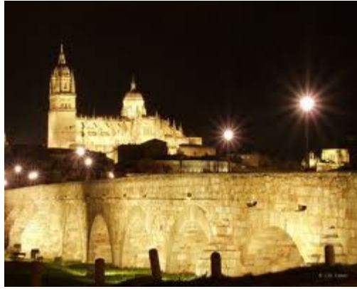
View of Salamanca – Cathedral and Roman Bridge

It is situated approximately 200 km (124 mi) west of Madrid and 80 km (50 mi) east of the Portuguese border. The University of Salamanca, which was founded in 1218, is the oldest university in Spain and the third oldest western university. With its 30,000 students, the university is, together with tourism, the economic engine of the city.