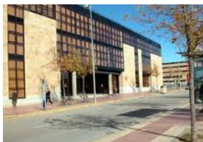
Facultad de Economía y Empresa – Main Entrance